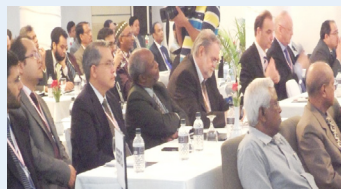
Speakers and VIPs during the Opening Session

The proceedings of the Seminar will be published in 2014.