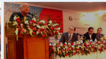
Session 3: Legal, Regulatory and Enabling Framework