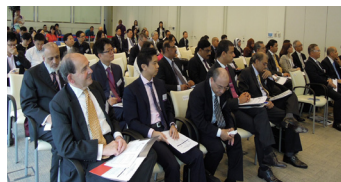
Seminar speakers and participants

Two topics included in the Roundtable were Prospects and Challenges of Islamic REITs and Infrastructures Conducive to Develop Islamic REITs. Eight chairpersons and speakers, as well as 20 participants, attended the Roundtable.