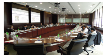
Roundtable on Islamic REITs