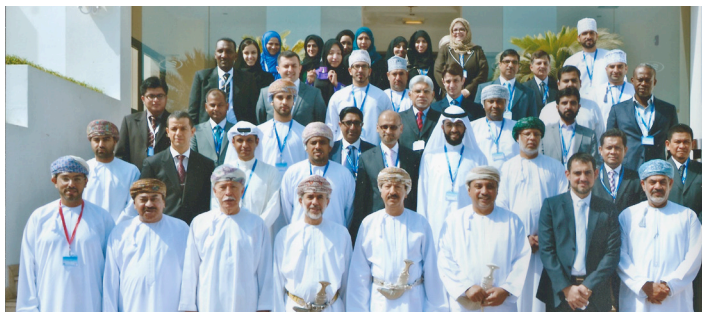
VIPs, IFSB Secretariat and participants at the workshop