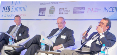
Panelists in the Knowledge Sharing Partner Session presented by INCEIF