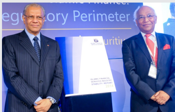
Prime Minister of Mauritius, Dr. The Hon. Navinchandra Ramgoolam and Governor of Bank of Mauritius, H.E. Ruudheersing Bheenick during the launching of the IFSB Stability Report 2014 .