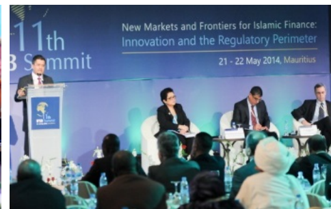
Session 3: Sukūk , Market Development and Regulation