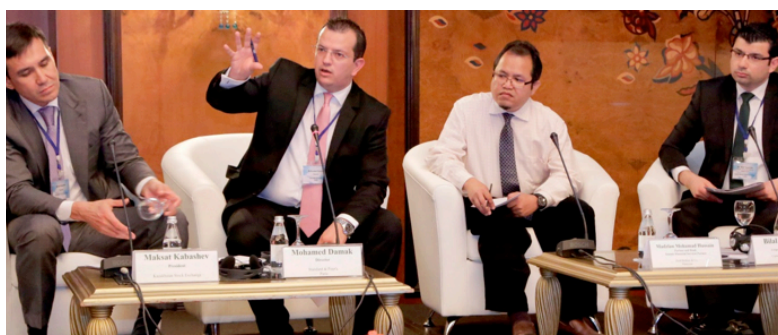
Session 2 deliberated the topic “The Role of Sukūk : Infrastructure Financing, Capital Market Instruments and High Quality Liquid Assets (HQLA)”