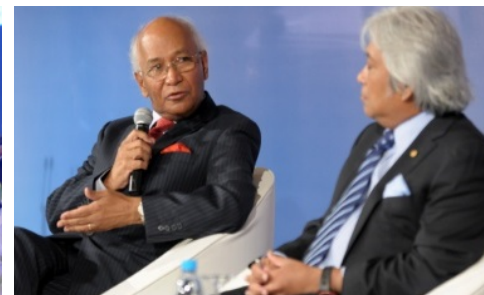
Session 5 - New and Emerging Islamic Finance Jurisdictions: Opportunities and Challenges Ahead