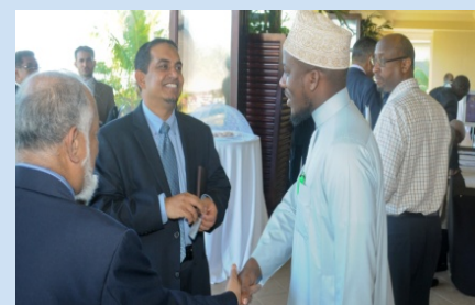
The Session provides networking opportunities among members