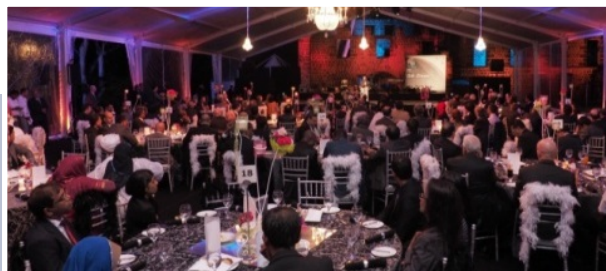
Delegates and invited guests during the Dinner