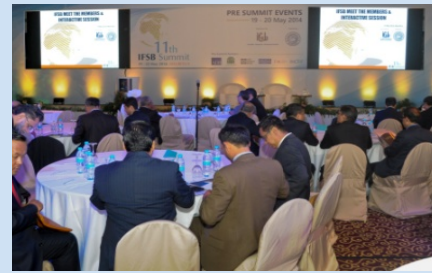
Participants taking their seats before the Session begins