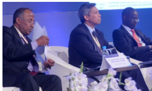
Session 4 - The Role of Islamic Finance in Economic Development: Promoting Financial Inclusion, Sustaining Innovation, Expanding the