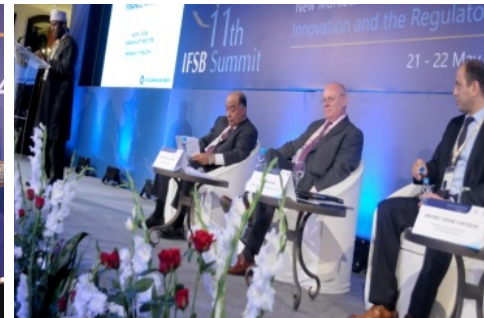
Session 1: Legal and Regulatory Environment of Islamic Finance