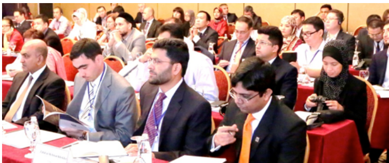
Participants attending the Seminar

On 17–19 June, the IFSB held “Facilitating the Implementation of Standards (FIS) Workshops” on selected IFSB banking and Takāful Standards. The workshops aimed to provide the participants with a better understanding of the IFSB’s Standards and their implementation process