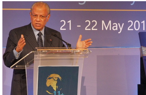
Prime Minister of Mauritius, Dr The Hon. Navinchandra Ramgoolam delivering the Keynote Address