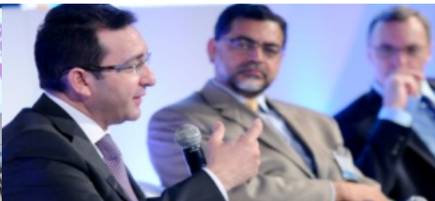
Panelists in the World Bank Session