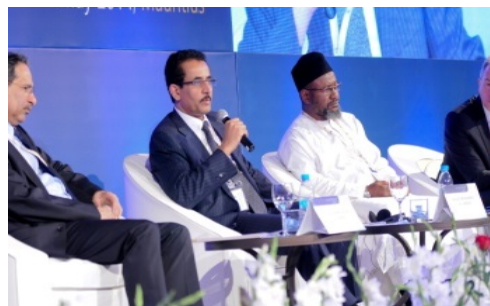
Session 2 - Global Overview of the IFSI: Outlook and Policy Developments