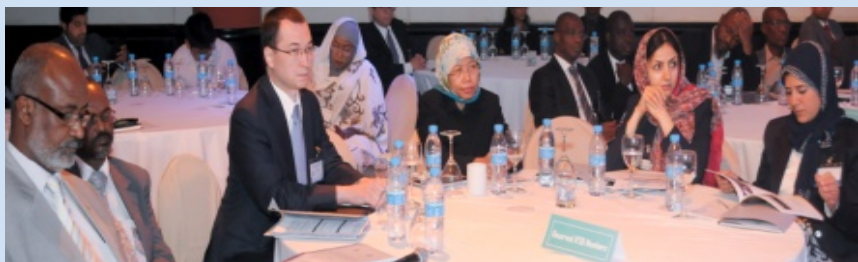
Participants listening to the presentations by the IFSB management