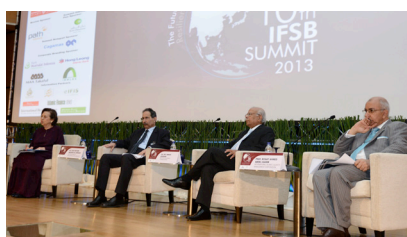
Session 5 - Panel Discussion on Lessons Drawn: Prospects for the Future