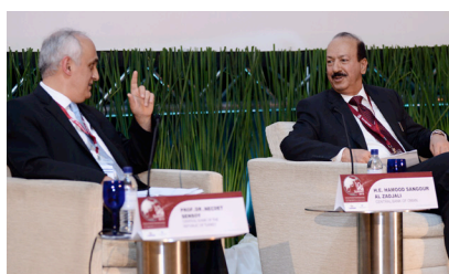
Session 3 - New Markets, New Frontiers - Prospects and Challenges