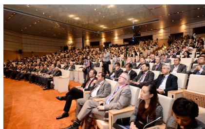
Session 1 - Financial Regulatory Reforms: Global Overview