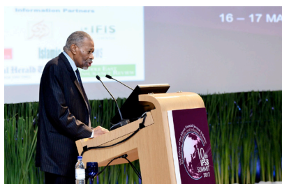
H.E. President of Islamic Development Bank delivering the Keynote Address

2013 marks a special year for the IFSB as the organisation celebrates its tenth year anniversary since commencing operations on 10 March 2003.