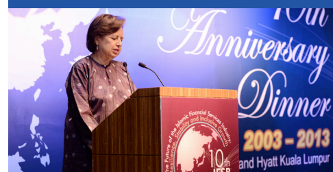
H.E. Dr Zeti Akhtar Aziz delivering Keynote Address

The highlights of the Dinner were the presentation of the IFSB anniversary video which received positive response from the guests and the plaque signing ceremony to commemorate the nine Founding Members of the IFSB. The anniversary video can be viewed at the IFSB website, www.ifsb.org .