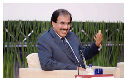
H.E. Governor of Qatar Central Bank chairing Session 2 - Cross-sectoral Approach to the Regulation of Islamic Finance and Market Development: Lessons Learnt