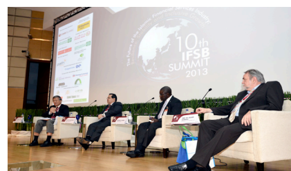
Session 4 - Islamic Finance: Innovation and Inclusive Growth