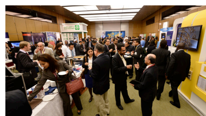
During Coffee break, participants in the Exhibition Area

On the evening of 16 May 2013, the IFSB organised its 10th Anniversary Dinner at the Grand Hyatt Kuala Lumpur. The Keynote Speaker for the evening was one of the Founding Members of the IFSB and Governor of Bank Negara Malaysia, H.E. Dr Zeti Akhtar Aziz. Also present were the former Governor of the State of Pakistan, H.E. Dr Ishrat Husain and former Governor of Central Bank of Sudan, H.E. Dr Sabir Mohamed Hasan.