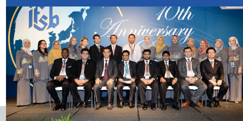
The IFSB Secretariat is based in Kuala Lumpur