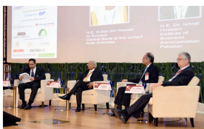
The Opening and Keynote Session